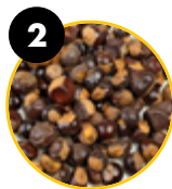
2 Guarana ( Paullinia cupana )