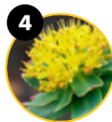
4 Rhodiola ( Rhodiola rosea )