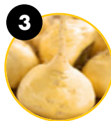
3 Maca ( Lepidium meyenii )