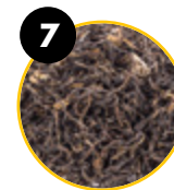
7 Green tea ( Camellia sinensis )

Iron is one of the minerals that contributes to normal energy metabolism.