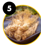
5 Korean ginseng ( Panax ginseng )