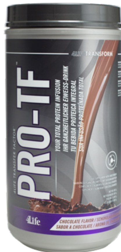
NET WT: 897 g Contains Sweeteners

DIRECTIONS: Combine one (1) scoop (19,5 g) powder with 240 ml of cold water. Shake or stir until dissolved. Expiry once opened: 30 days